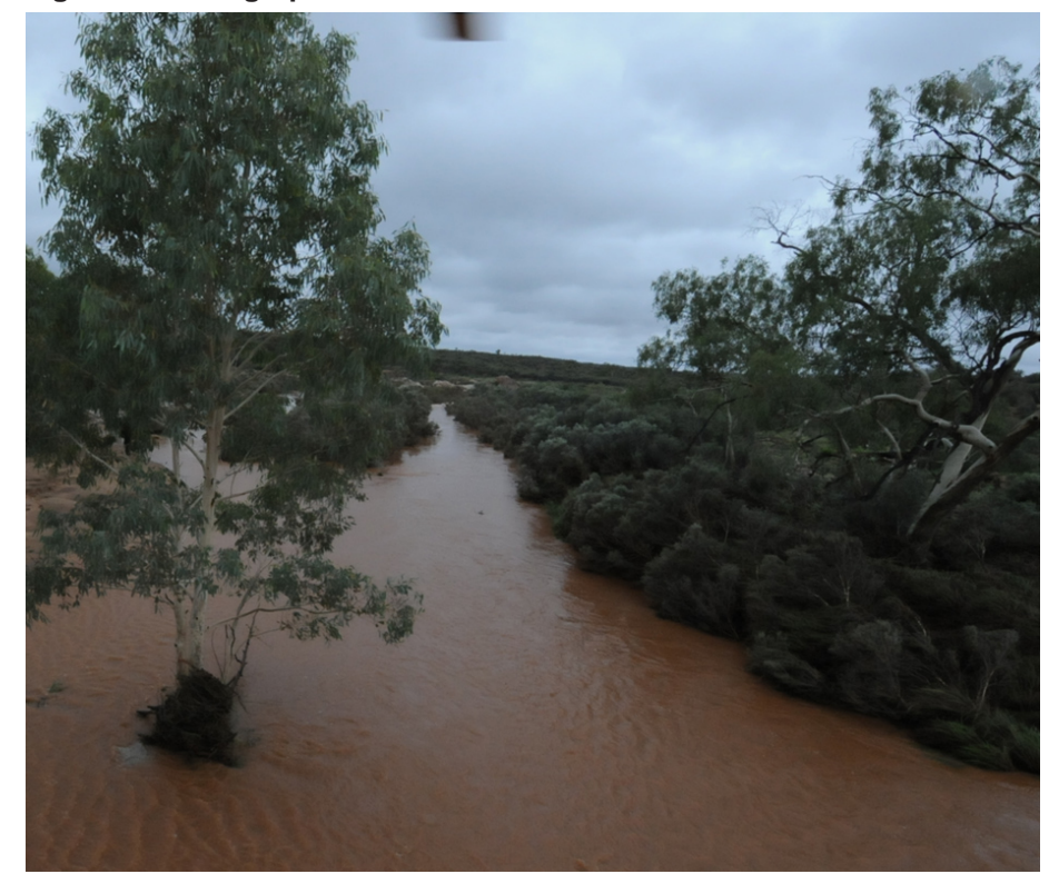
Figure 2: Photograph taken from left side of VH-YMD as it crossed the river